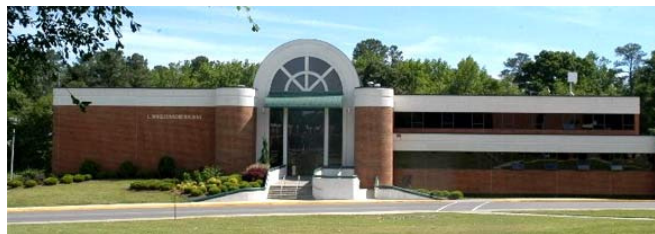
Anyone in need of special services or accommodations in order to participate in this program, please call in advance to make arrangements.